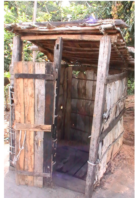
A community toilet.