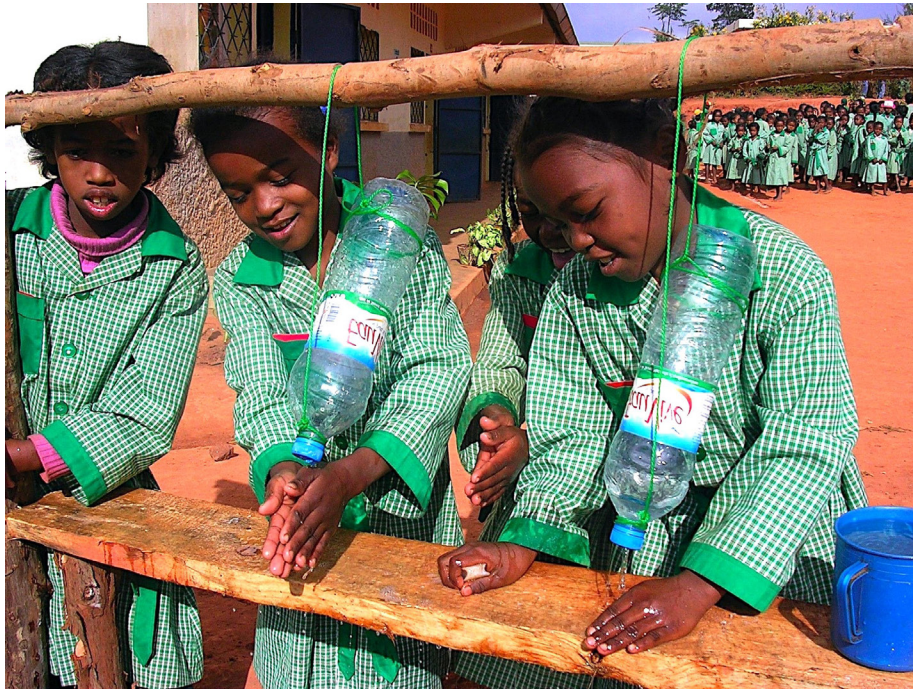
Children at a low-tech hand washing station.