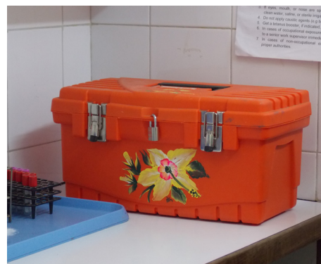
GHM travelers recently saw this first aid kit in use at Selian Hospital, TZ

In 2007 GHM received a donation of toolboxes. It was an unusual donation, not really fitting into our shipping program of medical supplies. But deciding to use the tool boxes for something, we filled some of them with first aid supplies, decorated them with hand painted flowers, sent them overseas and then waited for a response. The response was "please send more." That was the start of our first aid kit program. Eight years, more than 500 kits and many refills later, we are still getting requests. Now having to buy the boxes and some of the supplies, we are asking our supporters to help finance the first aid kit program. Generally the cost of each kit - and the shipping - is about $25. Can you help with this program? If so, please mark your check with "first aid kit" in the memo line.