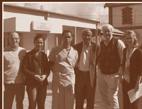
Bottom right: GHAP consultants in Madagascar.